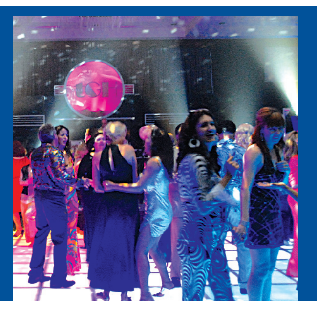
Guests discoed the night away at the 2007 Moments in Time Gala, Studio TGH.