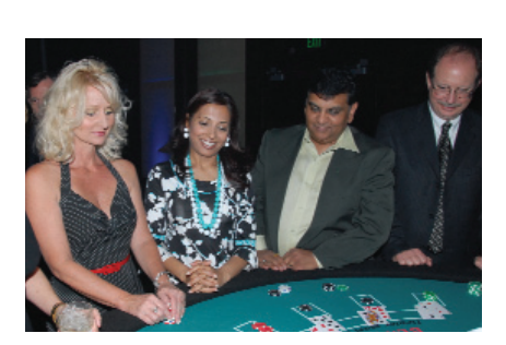
Who will win? The Black Jack tables were popular at Studio TGH.