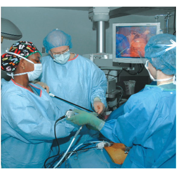
The Foundation raises money to purchase state-of-the-art equipment.

After touring our current NICU, one donor doubled his family's gift to the "Tiny babies. Big priority." Campaign. He wanted to "make sure every baby was cared for in a world-class facility as nice as the new Bayshore Pavilion." What better way to help our tiniest patients?