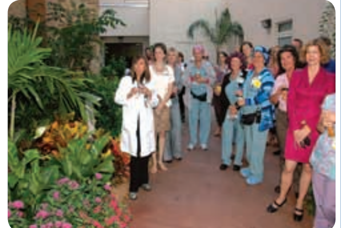
TGH employees gathered for the opening of the Employee Garden Retreat which was funded through the 2008 Employee Campaign.