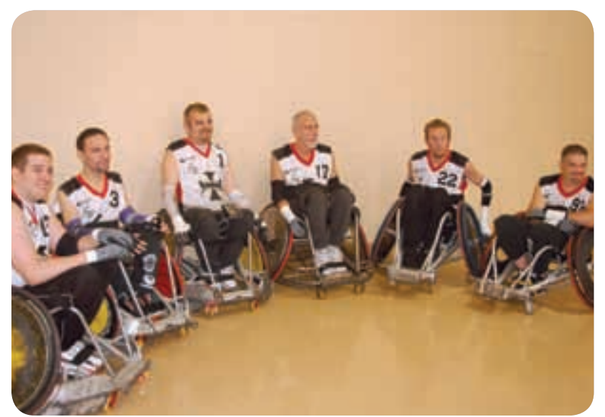
Members of the Tampa Generals Quad Rugby team gather prior to the start of tournament play.

Every January, the Generals host a three-day international rugby tournament where teams come from around the world to compete. The tournament is made possible because of the support from the Tampa General Hospital Foundation. The Tampa General Rehabilitation Center provides wheelchair accessible vans and recreational therapy staff to transport visiting teams during the event. Nurses and therapists use the tournament to reinforce to patients that a disability does not have to be limiting and that there are activities available for the spinal cord injury community. Patients not only need to hear about activities available to