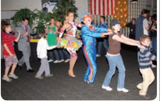
Circus clowns lead a line dance during the Patrons' Party.