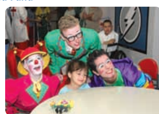
Clowns from Ringling Brothers and Barnum & Bailey's "Zing Zang Zoom" visited patients in the Children's Medical Center.

The need is great. Another example is families of babies in our Level III Neonatal Intensive Care Unit. This fund can provide help, such as cribs and baby supplies for needy families, or transportation to the hospital for families who live in distant counties.