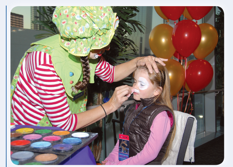
The face-painting is always a favorite for the children at the Circus Patrons' Partv.

Tampa General Hospital Surgical Trauma ICU