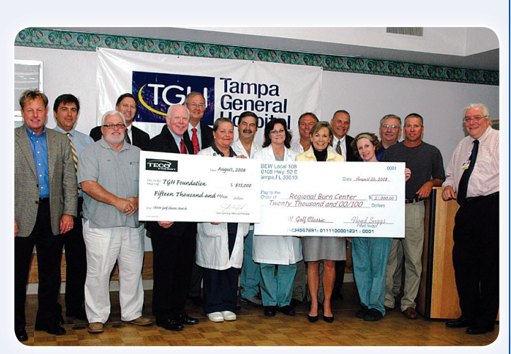
Representatives from TECO and the IBEW Local 108 presented a check to the Burn Center from money raised in their annual golf tournament.