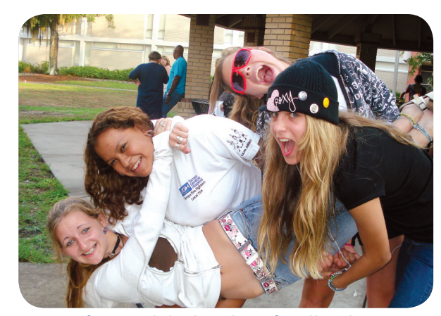
Campers enjoying themselves at Camp Hopetake.

Sometimes gifts come in a form other than money. Throughout the year, the Foundation and the hospital's patients have been blessed by gifts from individuals, companies and their employees and other community organizations. A really special example of this generosity was demonstrated by the employees of Melitta USA who wanted to do something special for the pediatric patients in our Children's Medical Center. They raised money and made personal donations to purchase games and toys for the children to use while staying in the hospital. These are kept in the Lightning Playroom which was jointly funded by Melitta and the Lightning Foundation through proceeds from Glitz and Sticks and are also available for patients too sick to leave their rooms.