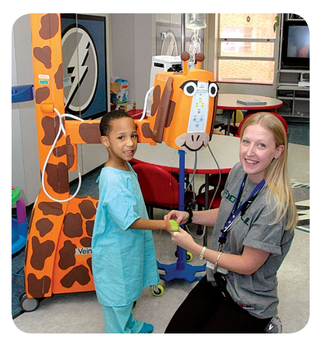
The Foundation purchased a Vein Viewer for the Children's Medical Center.

All of our patients have different needs, and the children who are patients in the Children's Medical Center are no exception. This year